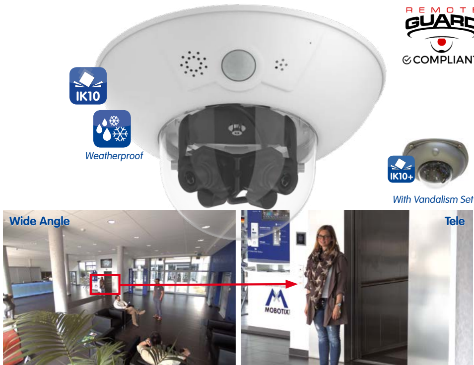
Adjustable lens modules can capture two different areas simultaneously.